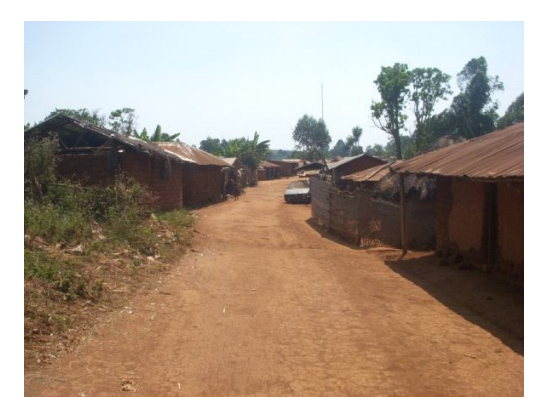
Figure 3a-b. Section of the Yelwa community