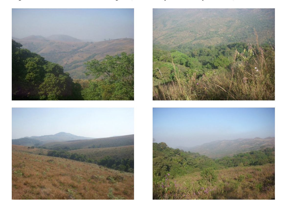
Figure 5a-d illustrates the topography of the forest reserve

Fig. 4. Map showing Mambilla Plateau, Taraba State, Nigeria