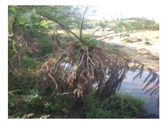
Figure 6a-f. Pictures illustrating the biodiversity of Ngel Nyaki Forest Reserve