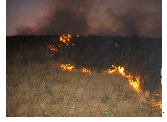
Figure 8a-b. Burning of the montane grassland by the Fulani herders

forest trees are animal-dispersed in Malawi (Dowsett-Lemaire 1988) and Cameroon (Maisels et al. 2001). Chimpanzees are likely to be important seed dispersers of larger seed, especially as other common monkeys are seed- spitting cercopithecines (Chapman 1995), and because birds with gapes wide enough to ingest large seeds, such as tauracos ( T. persa, T. leucolophus and Musophaga violacea ) and pigeons ( Columba