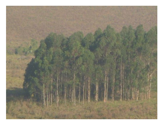
Figure 7a-b. Pictures showing the Eucalyptus plantations

Chapman et al (2004) reportedly observed in 2002, physical damage to the forest in form of slash and burn agriculture was