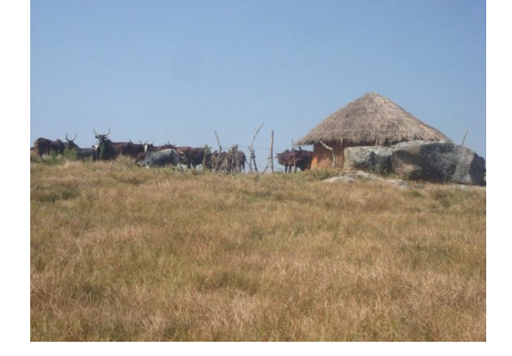
Figure 2a-b. Fulani cattle herders, their cattle and their sheds

people, which include Gembu (the largest town), Dorofi, Nguroje, Ngelforo, Wakili Buba and Maisamari. Other agricultural crops include plantain, a special variety of pepper which when ripe, the flesh is yellowish-orange instead of the common red colored ripe pepper fruits; and a special variety