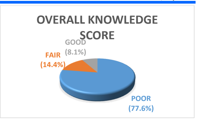
Figure 3: Pie chart showing the overall knowledge score of respondents on pentavalent vaccines

Figure 2: Pie chart showing the source of information regarding pentavalent vaccine