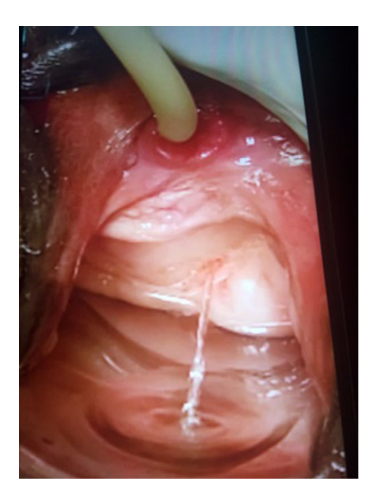
Figure 1: Direct dye test: 300 ml methylene blue instilled into the bladder through Foley catheter shows no dye leak, but a clear stream of urine spilling from the left ureter.