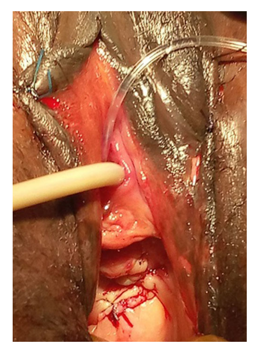
Figure 3: Anterior vaginal wall closure with ureteral and urethral catheters exiting from the external urethral meatus.